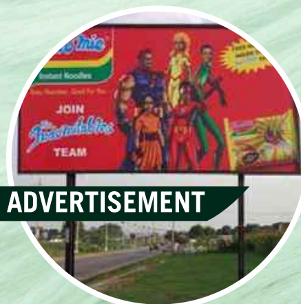
OUR BILL BOARD ADVERTISEMENT